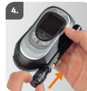
4. Put cap back on.