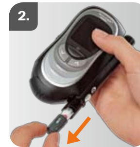
2. Remove used lancet drum.