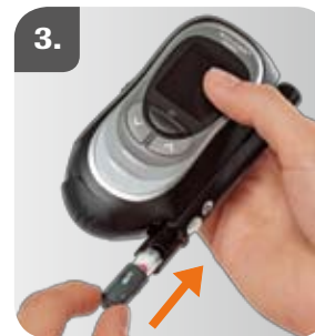
3. Insert new drum. Used lancet drum shows red stripe and cannot be re-used.