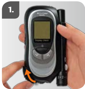
1. Open tip cover. Slide completely to the left until meter switches on.