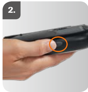
2. Slide side button down to open cassette door.