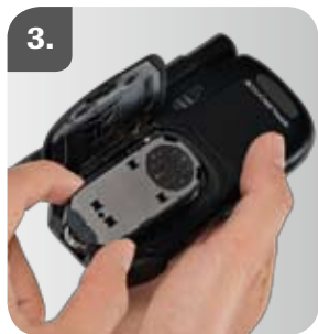
3. Remove used cassette and insert new cassette.