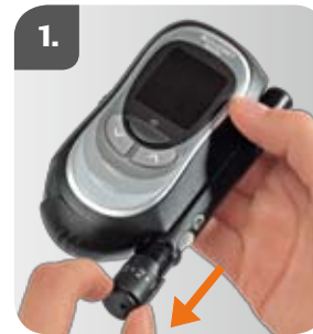
1. Take off cap.