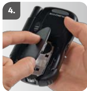
4. Close cassette door first, then shut tip cover.